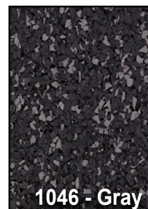
1046 - Gray