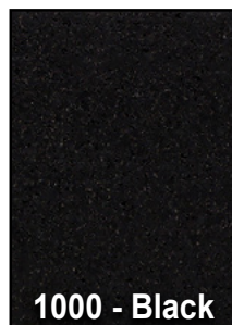
1000 - Black

Proprietary Installation System Quad Blok